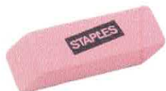
example of a block eraser